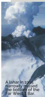
A lahar in 1995 narrowly missed the bottom of the Far West T Bar.

LAHARS PATHS: Eruptions generate lahars (volcanic mudflows) that can pass through valleys in the ski area.